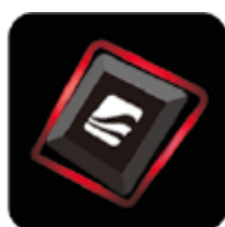
Red – high