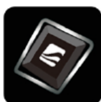
White – medium