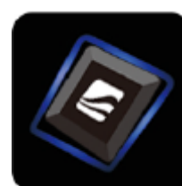
Blue – low